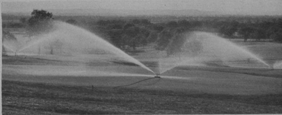
Beautiful Southern Hills Golf Course, Tulsa, Oklahoma.