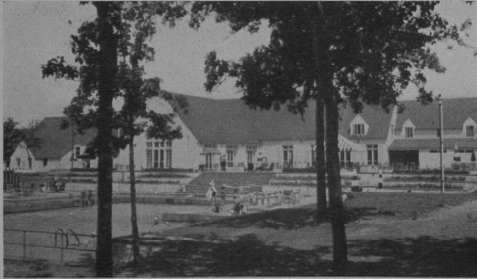
A veranda overlooks the large swimming pool of Southern Hills and is the stage for many of Tulsa's smartest social affairs. This view was taken from entrance to tennis courts.

tor with Kelvinator units, Sav-more roaster, Blakeslee vegetable peeler, Colt Auto-San dishwasher and a Hobart mixing machine. International silver, Liddle linen, Shenango china, and No-nik glassware are used for service. In refrigeration equipment the club has a heavy investment. The meat and vegetable boxes were designed by Motz in collaboration with refrigeration engineers. The boxes are insulated with Armstrong insulation and are properly ventilated. The Southern Hills refrigeration equipment, in addition to caring for food storage, furnishes 200 lbs. of ice per day for cubes.